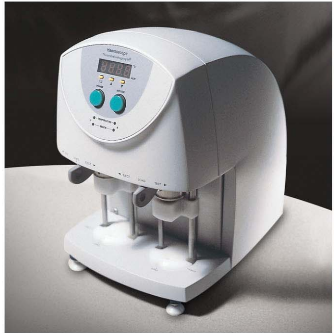
HAEMOSCOPE TEG® Blood Analyzer

CESARONI DESIGN® product design consultants