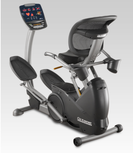
OCTANE FITNESS Seated Elliptical xR3 Series, Mesh Seat Design